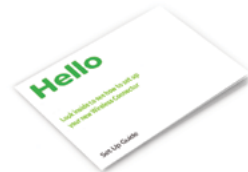
Set Up Guide

If you're missing any of these items please go to sky.com/ondemandhelp